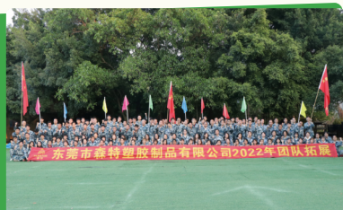
Guanyin Mountain Team building