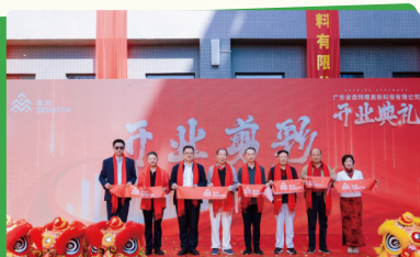
Huizhou SENGTOR opening ceremony