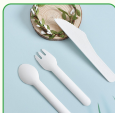
Knife Fork Spoon