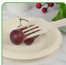
Knife Fork Spoon