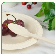
Knife Fork Spoon