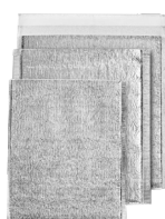
Food heat insulation bag