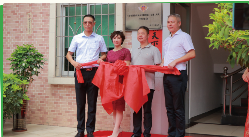
Defense cooperation units signing and awarding ceremony