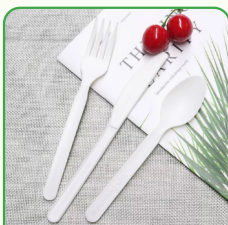
Knife Fork Spoon