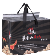
Food heat insulation bag