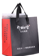
Food heat insulation bag