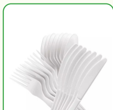
Knife Fork Spoon