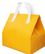
Food heat insulation bag