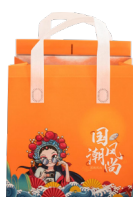
Food heat insulation bag