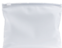
Zipper Lock Bags