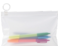
Zipper Lock Bags