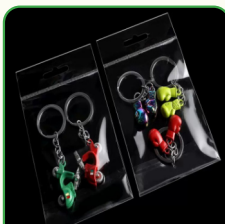
Card Head Bags