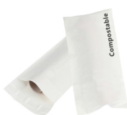
Card Head Bags