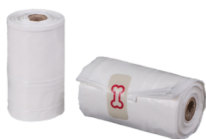
Dog poop water-soluble bag