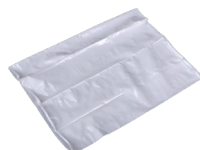
Dog poop water-soluble bag