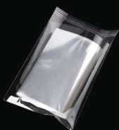
Card Head Bags