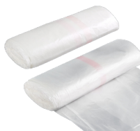
Water-soluble bag for vests