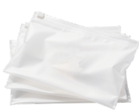
Zipper Lock Bags