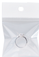
Card Head Bags