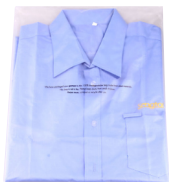
Card Head Bags