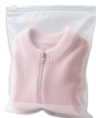
Zipper Lock Bags