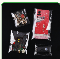
Card Head Bags