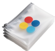
Zipper Lock Bags