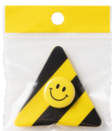
Card Head Bags