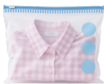
Zipper Lock Bags