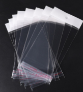
Card Head Bags