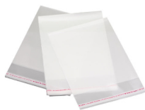
Card Head Bags