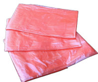
Water-soluble laundry bag